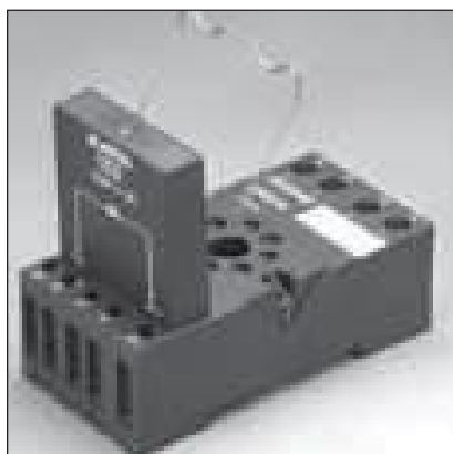
ZKE 088 matching for SKR 085 / 128