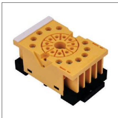
ZKR 119 matching for SKR 115 / 138